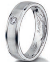
Hand engraving English Script