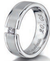
Laser engraving English Script