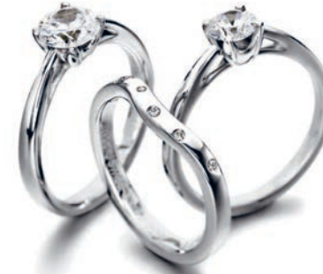
53-66463 | 71-83660 | 53-66461