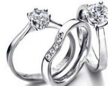
53-66512 | 71-83640 | 53-66514