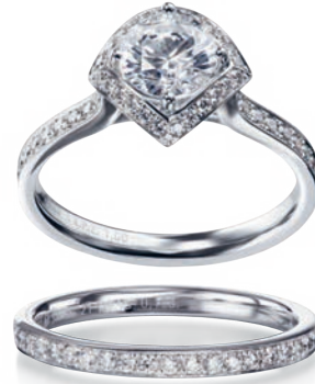
53-66681 | 62-53100