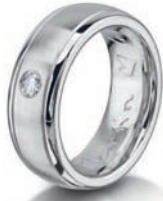
Hand engraving Individual handwriting