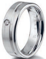
Mechanical engraving BLOCK LETTERS