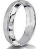
Laser engraving Fingerprint and text