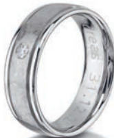
Laser engraving BLOCK LETTERS