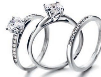
53-66471-P | 52-66471 | 61-52080