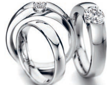
53-66480 | 72-01020 | 53-66484