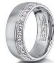
Laser engraving Poem