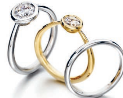
53-66534 | 53-66531 | 72-18860