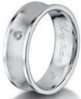
Mechanical engraving English Script