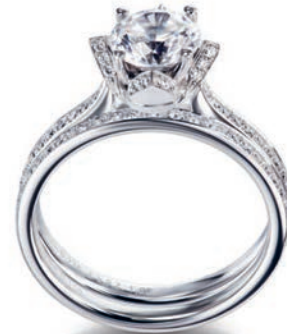
53-66781 | 62-53100